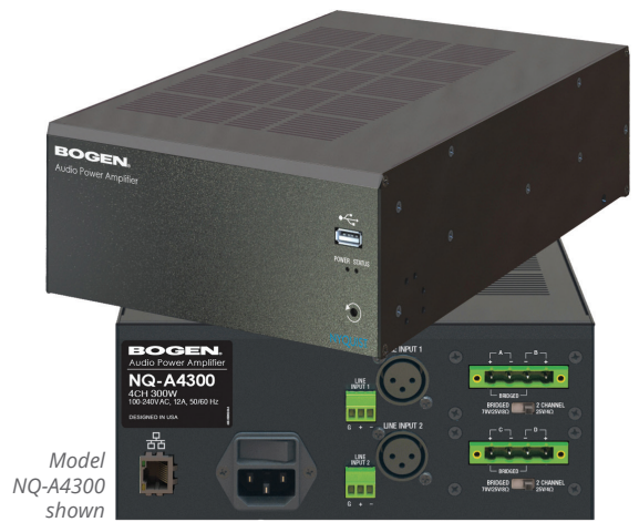
Model NQ-A4300 shown