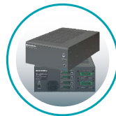
Nyquist 4-Channel Audio Power Amplifiers