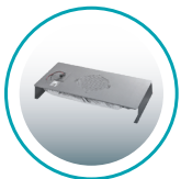
Suspended Ceiling Grid Sound Masking Speaker