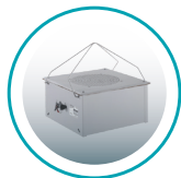
Variable Firing Sound Masking Speaker