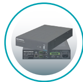
Nyquist 2-Channel Audio Power Amplifiers