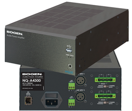
NQ-A4060, NQ-A4120, NQ-A4300 Audio Power Amplifiers (60W, 120W, & 300W 4-CH models)