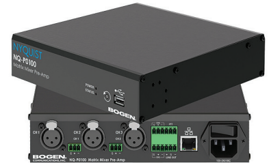
NQ-P0100 Matrix Mixer Pre-Amplifier