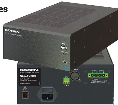
NQ-A2300 Audio Power Amplifier (300W 2-CH model)