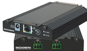
NQ-GA20P2 20W Integrated Amplifier