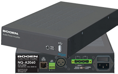
NQ-A2060, NQ-2120 Audio Power Amplifiers (60W & 120W 2-CH models)