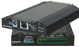
NQ-GA10P, NQ-GA10PV 10W Plenum-Rated Intercom Modules (PV model available with HDMI video-out)