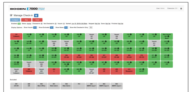
Emergency Facility Check-In feature enhances building/site security

To download the Ver. 2.0 Release Notes and view all the details, visit: http://www.bogen-ip.com/c4000-resources/