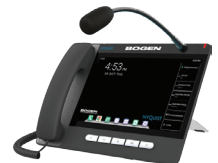
Zone Paging Microphone Station NQ-ZPMS

Contrary to emergency notification systems , which generally deliver emergency information in one direction, emergency communication systems can both initiate and receive information between multiple parties.