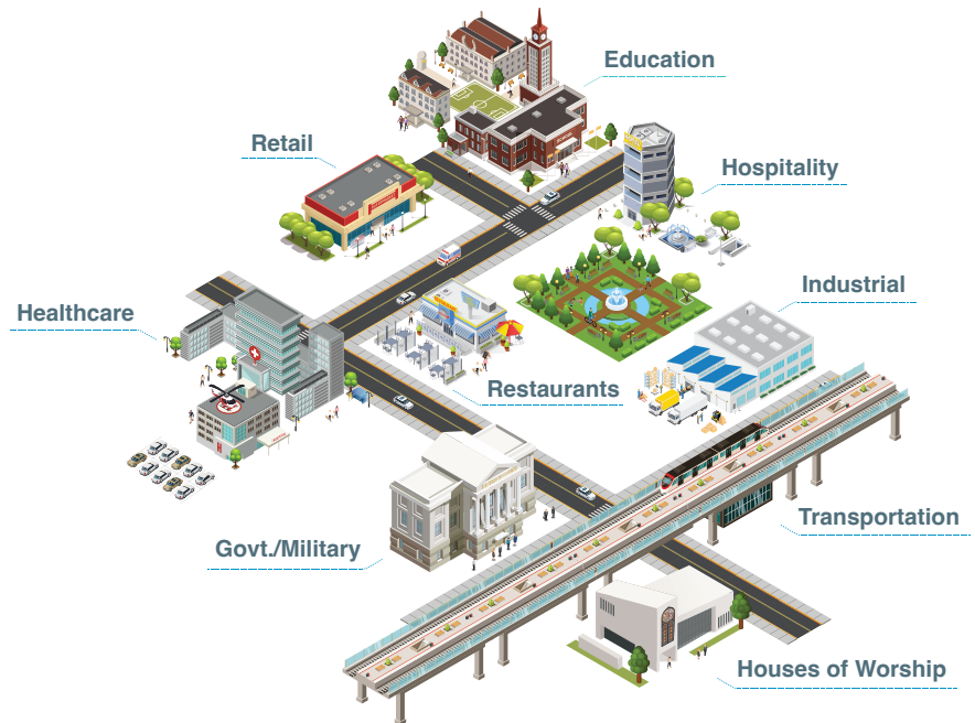
Figure 1: ECS applicable markets and environments