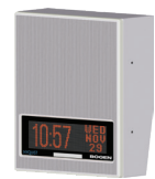
Nyquist VoIP Wall Baffle Combo Speaker NQ-S1810WBC